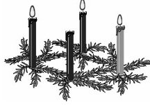
Blessed Sacrament Church