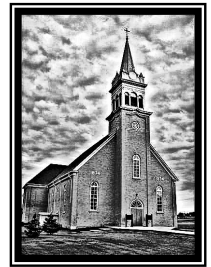
St. Eustache Church