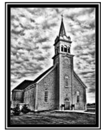
St. Eustache Church