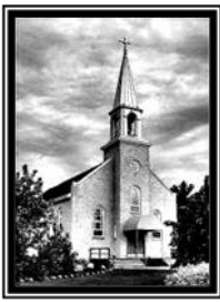
Blessed Sacrament Church